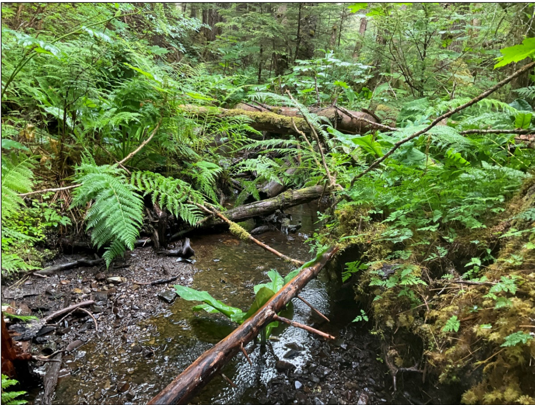
Figure 2.—Channel at waypoint 1175.