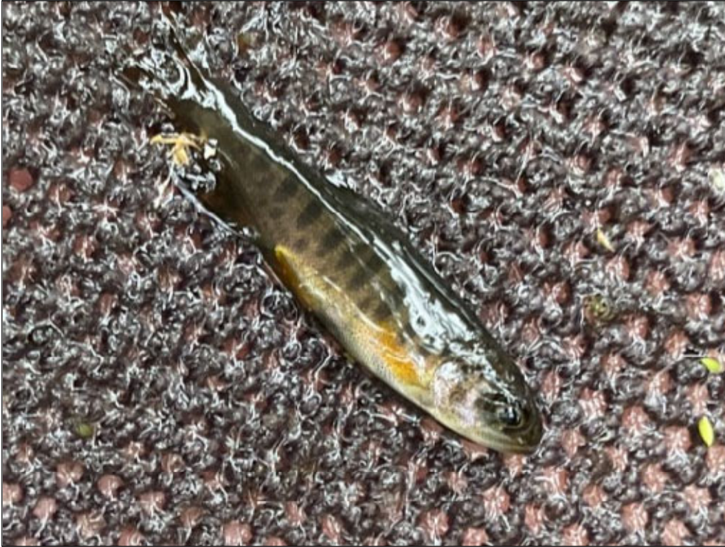
Figure 1.—Juvenile coho salmon captured at waypoint 1175.